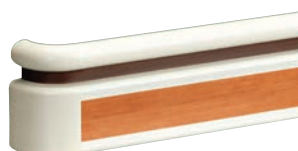
BHR-169 목무늬 라인 적용 Wood-patterned line on Guard part