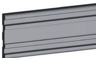
HDWG-200 W200mm x D30mm

Soft synthetic resin Standard or custom available (Only dark colors)