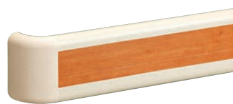
BHR-149 목무늬 라인 적용 Wood-patterned line on cover