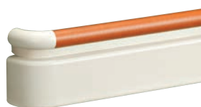
손 스킴 별도 색상적용(목 무늬 가능) Accent color on Handgrip (Available wood-pattern)