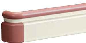
BHR-165 BHRQ - 165