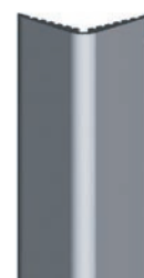
HDCG-100 W90mm x 90mm x D5~10mm