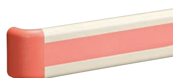
BHR-145 엑센트 컬러 라인 적용 Accent colored line on cover