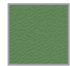
423 Light Greenish For CuS-Rail

※The color of the real product may be differently seen depending on the type of light, an intensity of illumination.