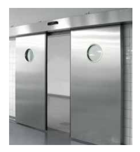
The Gilgen SLX-V sliding door drive unit is also the perfect choice for large and heavy door leaves.